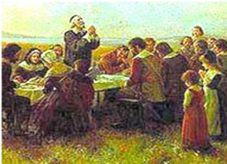
Eating goose at St Michaelmas

“He who eats a goose on Michaelmas Day, Want not for money all the year.”