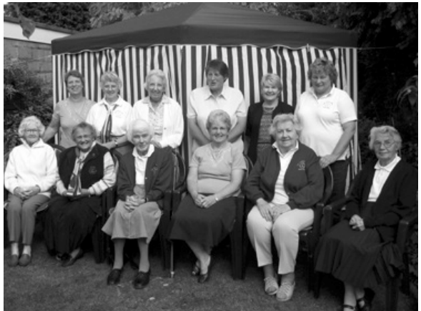
The Waffle Party