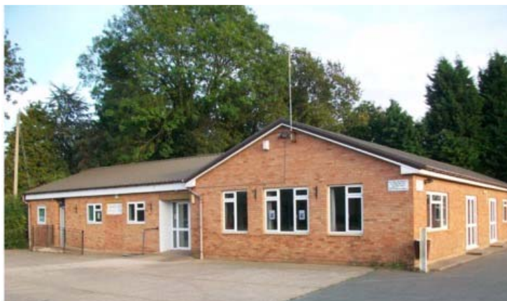
Martley Memorial Hall today

"Memorial Hall – An army hut, erected near the centre of Martley, on a good brick foundation, the outside dressed with a preservative and the interior papered and decorated, forms the excellent Memorial Hall at