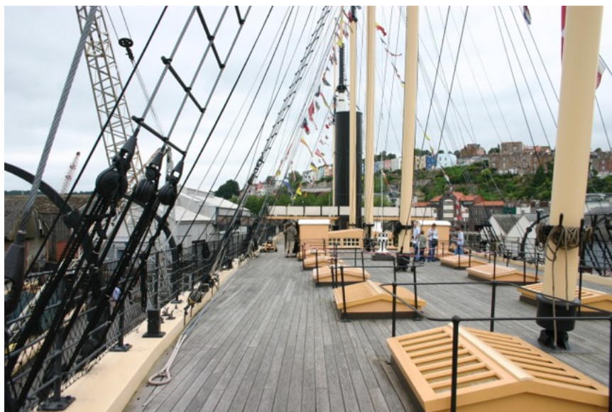
A view along the deck of SS “Great Britain”

Then we were taken on deck and we could see how well the massive task of restoration had been done. Walking along the deck we passed sheds where cows, pigs and chickens were kept to provide milk and fresh meat for the passengers on their long journeys, to the steering wheel ‘aft’. Tricky to steer such a large ship, looking across to the bows from the stern. There we met Isambard