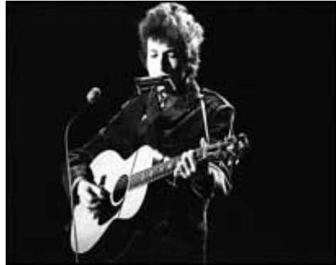
Bob Dylan in the 1960s