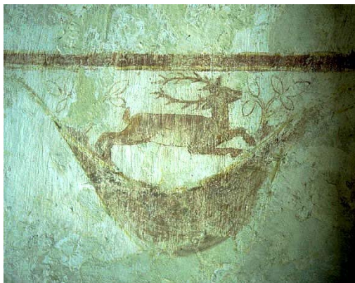
Running Stag/'Stoning & Roses' pattern, Martley, Worcestershire (≠Worcester) Mid C.14