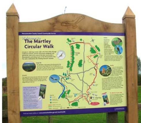
The new map by the Millennium Green