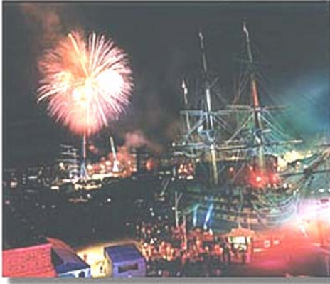
The HMS Victory on Trafalgar Day