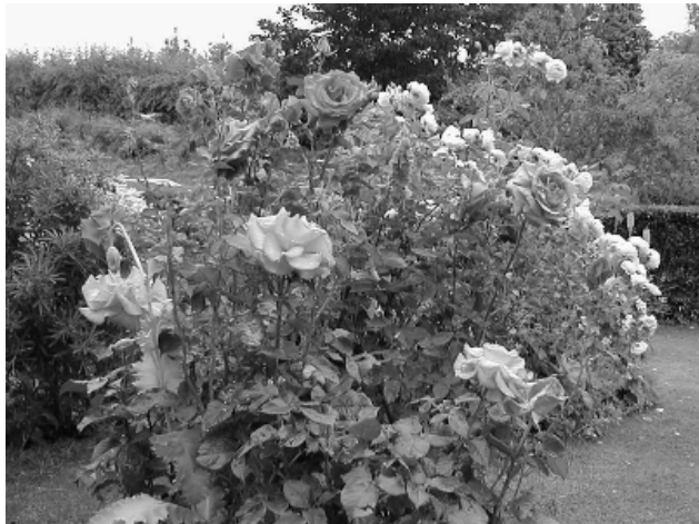
Roses in the garden of Rosie Cannon in Wichenford open for the Open Gardens weekend