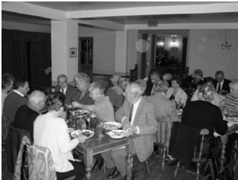
The Ramblers enjoy their annual dinner