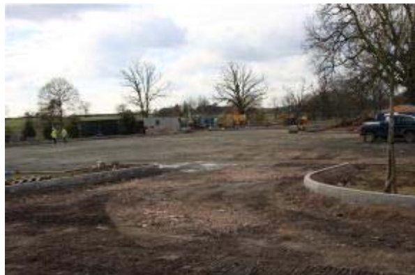
Working on our new main carpark

The Angling Academy is now formed and has a willing committee of volunteers. We have registered with a