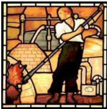
The Agricultural Labourers' Union

It was resolved to accept the minutes as a true record, after one amendment.